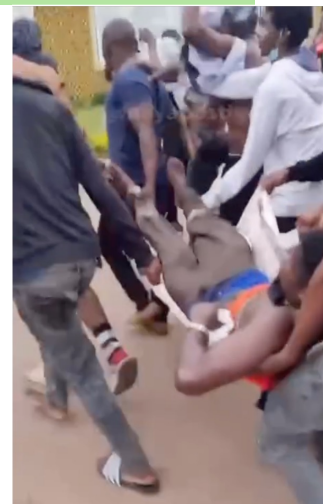
Maputo 7 November

Hanlon - LSE - 12 Nov 2024 - updated 14 Nov