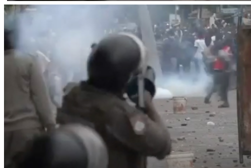
Maputo 7 November