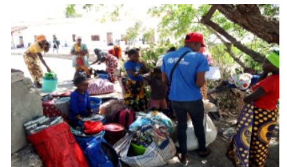
DTM supporting the registration of new arrivals.

IOM is supporting the SDPI on the reception of new arrivals, leading the registration and data collection process for new arrivals in coordination with DTM. PSEA sensitization has also been provided to the new arrivals. Community representatives are also supporting the reception of new families and registration. The community leaders have also played a crucial role in allocation of temporary accommodation.