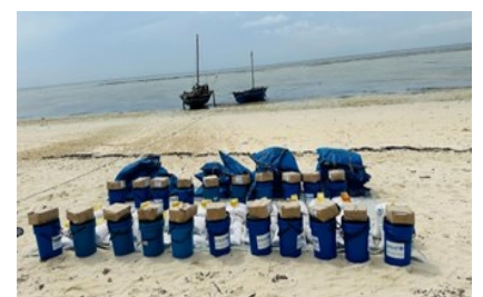
Hygiene kits distributed by UNICEF

The district has serious water problems, and the few water points in the communities are saline. UNICEF distributed hygiene kits to the new arrivals before February 15th, so there is still a need for more hygiene kits for the last batch of 251 HH. There are no functional latrine and there is spiraling of open defecation.