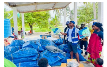
IOM, WFP and UNICEF Joint Response.

Food is a critical and urgent need for the newly displaced families, WFP provided 20kgs of rice, 2 liters of oil and 10kgs of beans as emergency food kits. There is still a need for additional food support for 251 HH.